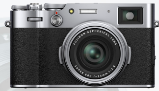
SILVER MSRP: $1800