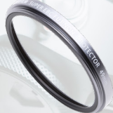
PROTECTIVE FILTER PRF49 MSRP: $70