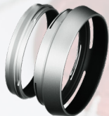
LENS HOOD & ADAPTOR LH-X100 MSRP: $100