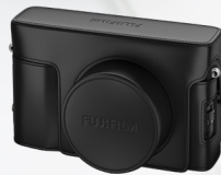
X100V LEATHER CASE, BLACK MSRP: $100