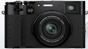
BLACK MSRP: $1800