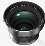
TELE CONV. TCL-X100 II MSRP: $450