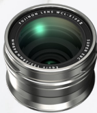
WIDE CONV. WCL-X100 II MSRP: $450